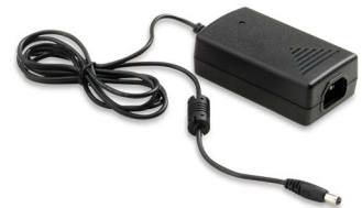
U1780A Power adapter and cord (according to country)