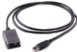
U5481A IR-to-USB cable