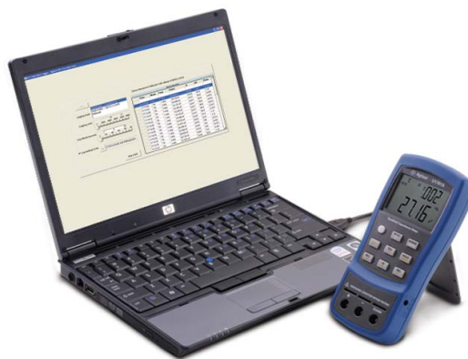
Figure 1: Automate the recording of continuous readings when you hook the U1701A to a PC

The U1701A comes in a robust overmold and tested to stringent industrial standards. Each U1701A is also sealed with a three-year warranty and the assurance that you can test your components with confidence.