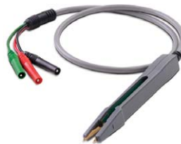
U1782A SMD tweezer