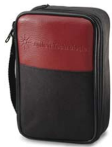
U1174A Soft carrying case